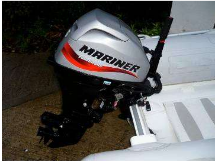
Image of Actual Motor