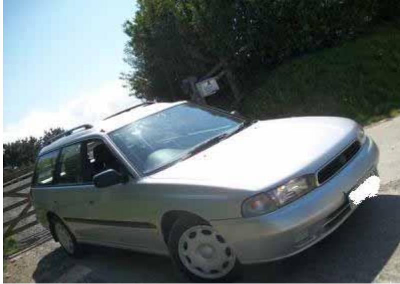
This vehicle is of interest and if seen please report to Police.